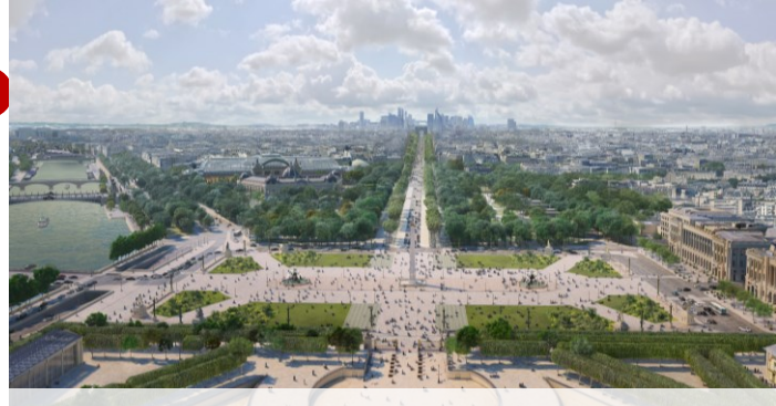
CHAMPS-ELYSEES AVENUE Strategic Urban Design

-Architecture : New Build and Renovation, Mixed Use buildings Heritage, Office buildings, Cultural Venues Interior Design, Urban Design, Applied Research.