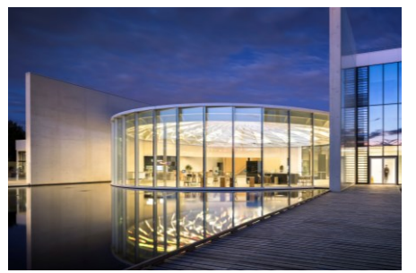
R&D Headquarters | Air Liquide | Paris-Saclay, France