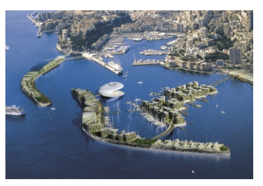
Urbanization within the sea Monaco

Museums and cultural and scientific centers of the sea Marinas and coastal developments, maritime station Sports and leisure equipment Hotels and restaurants