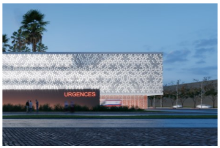
Smart Health Care City | Ben Guérir, Morocco