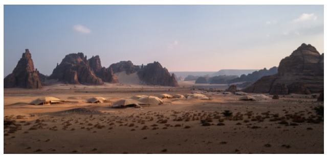
Banyan Tree AlUla tented resort, AlUla, Kingdom of Saudi Arabia

AW<sup>2</sup> has received several awards over the years including the MIPIM Best Hotel Award for the Six Senses Con Dao resort, the Build Architecture Award for Best International Architecture & Design Studio – Paris, and four nominations for the AFEX Grand Prize in French Overseas Architecture for Six Senses Con Dao in Vietnam, the Lycée Français in Amman, Jordan, Ani Private Resort & Art Academy in Sri Lanka and Kasiiya Papagayo ecolodge in Costa Rica.