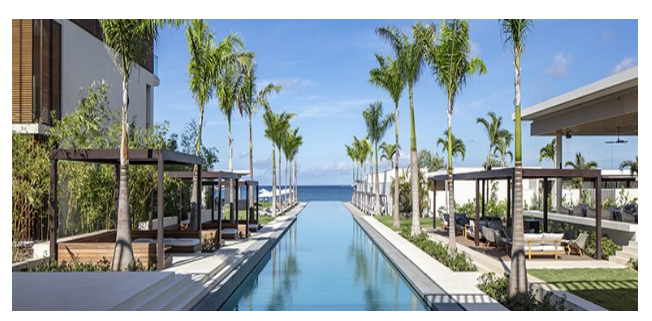
5* resort Silversands, St. George's, Grenada