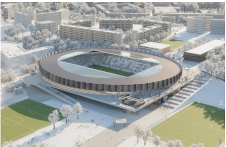
Torpedo Stadium | Moscow, Russia