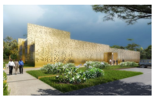
BEAC Headquarters, Equatorial Guinea

References : ZUO is a design, architecture and urbanism firm specializing in complex, multi-functional projects. ZUO is a key actor in the sector.