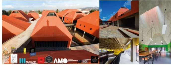
FAED School of Architecture - Kigali - Rwanda