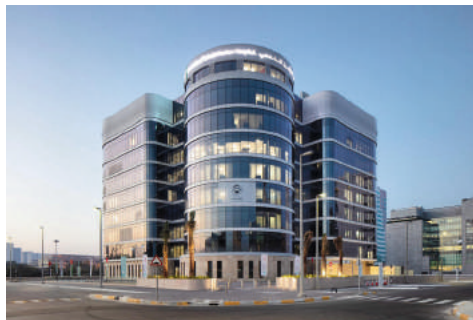
Specialized Rehabilitation Hospital, Abu Dhabi, UAE