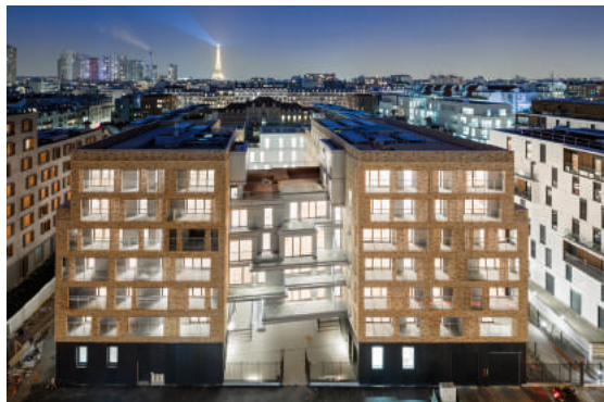
Boucicaut Project, Paris