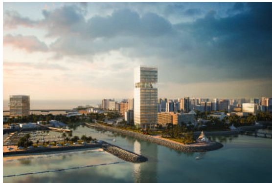
Competition for Koweit Foundation for the Advancement of Sciences

This approach gave them the opportunity to complete 40 projects mainly in Paris and Lyon. Since 2019, PPX is leading 4 big scale urban projects in Moscow and Tyumen (Russia). More than 50 projects are currently underway, including the athletes' village for the 2024 Olympic Games, 500 housing units in a large-scale project in Nice and 4 mixed-use projects in Luxembourg.