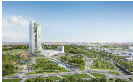
IBN Sina University Hospital, Rabat, Morocco

Our key expertise in <Health and Well-being>, <Industrial Facilities>, <Urban Planning> and <Generative City> allows us a multi-disciplinary approach for each project.